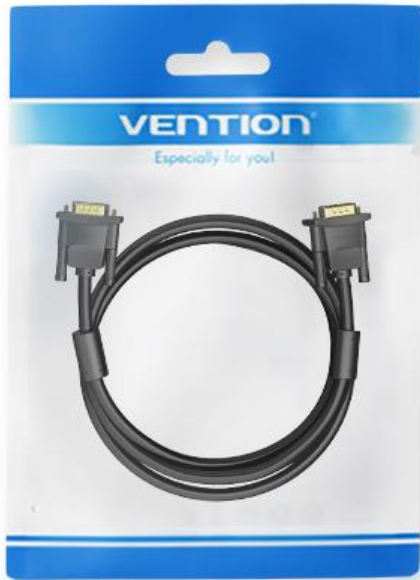
1-5m PE Bag