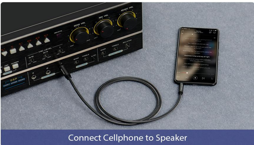
Connect Cellphone to Speaker