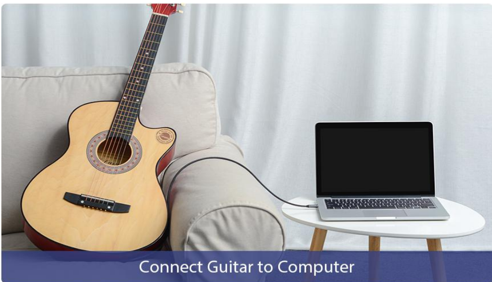
Connect Guitar to Computer