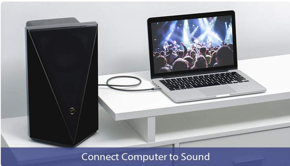
Connect Computer to Sound