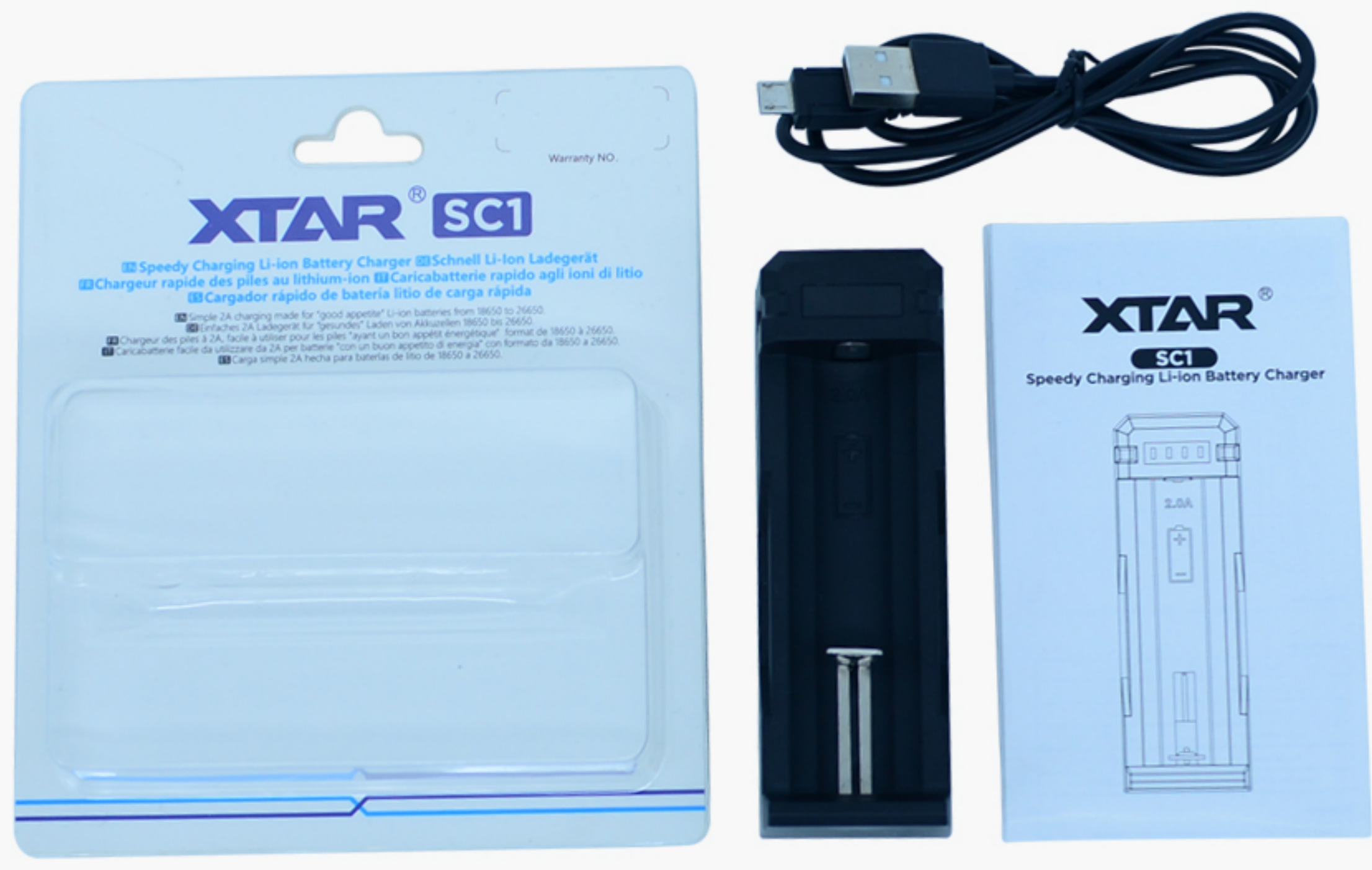
Multi-language Version SC1 battery charger, USB cable, Manual