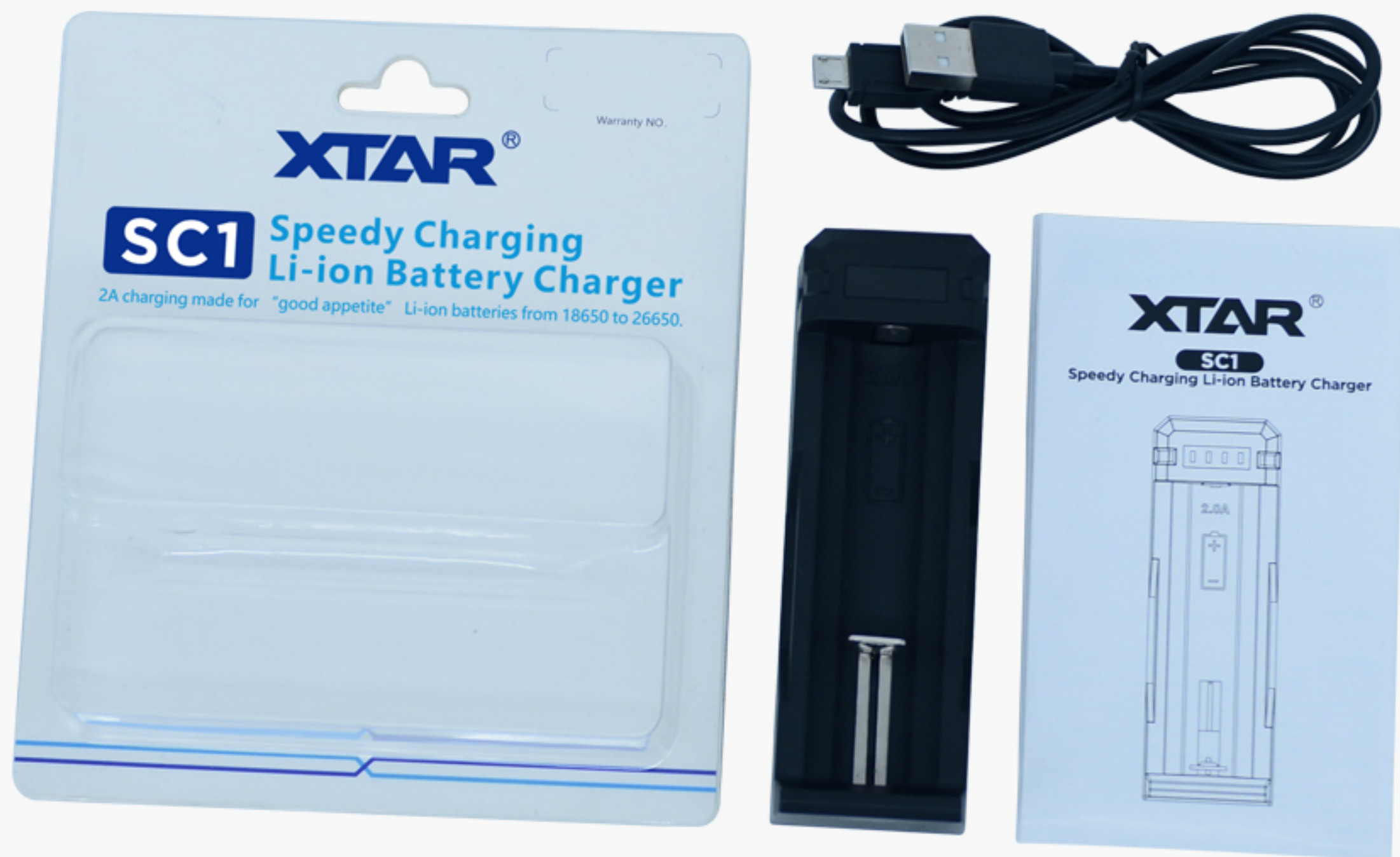
English Version SC1 battery charger, USB cable, Manual